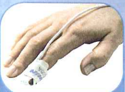
7000A Adult Flexi-Form II (> 30 kg / > 66 lb)

*Optional Reusable Sensor Extension Cables are available in 1m, 3m, 6m and 9m lengths.