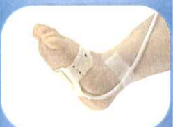
7000N Neonatal Flexi-Form II (< 2 kg / < 4 lbs)