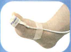
7000I Infant Flexi-Form II (2 - 20 kg / 4 - 44 lbs)