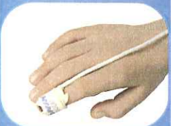
7000P Pediatric Flexi-Form II (10 - 40 kg / 22 - 88 lbs)